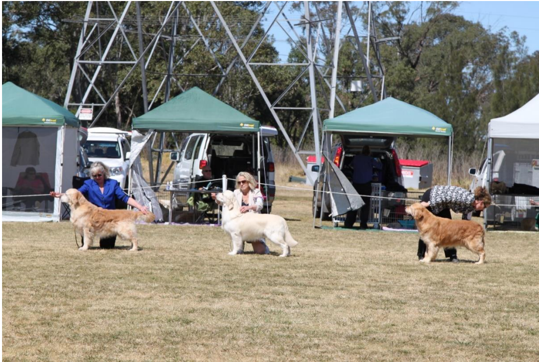
Photo below L/R Ch Goldew Southern Son, Ch Piarki Winston's Golden Ticket, Alnclair Crackerjack Crosby

Photo below L/R Ch Larbellah Team Leader, Gr Ch Fantango Playing the Game (AI)., Ch Goldew Southern Son