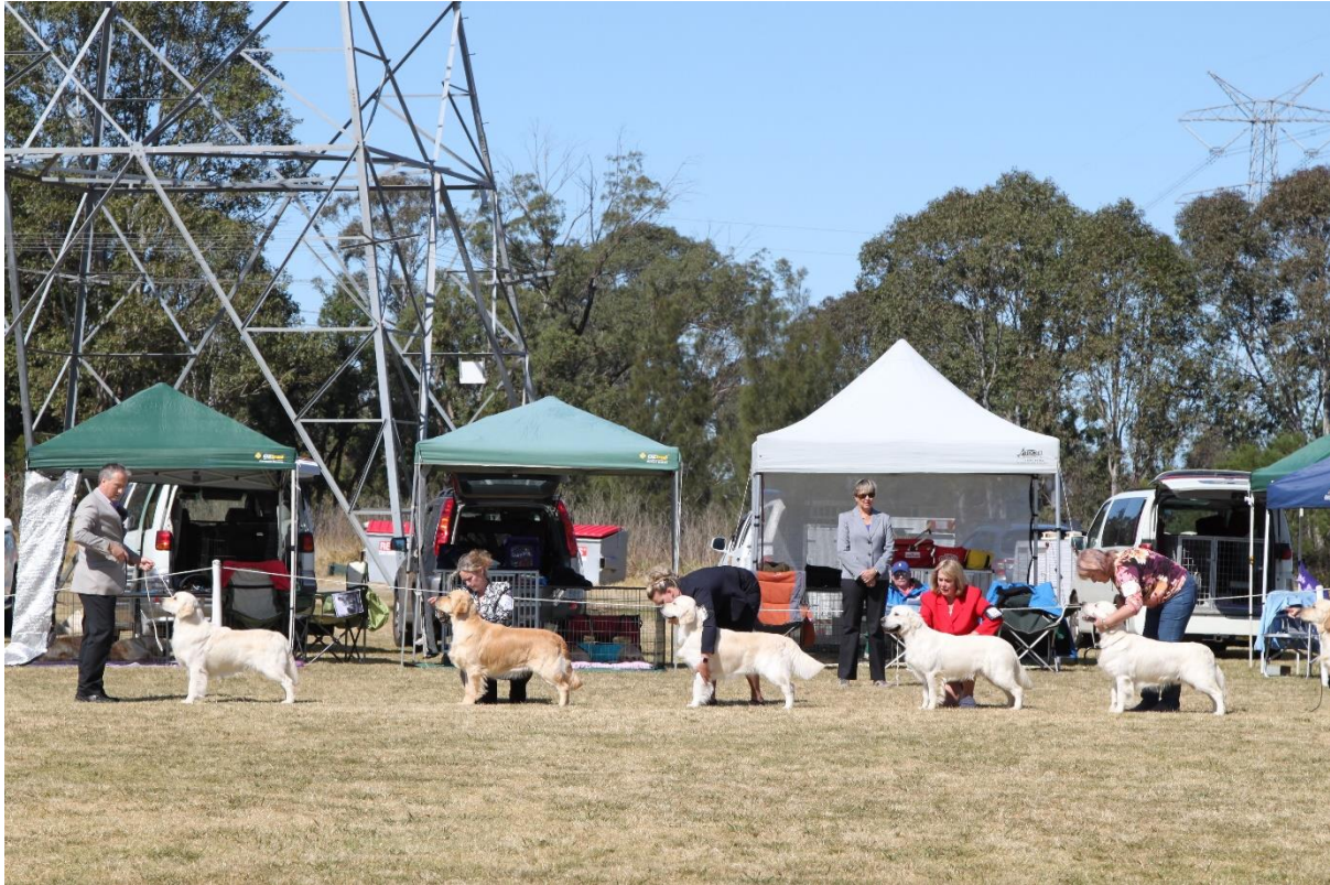
Photo below L/R Fantango What Happens in Vegas (AI), Ch Shtar Seal of Approval, Ch Piarki Winston's Golden Ticket, Parkridge Cause I Can, Zenevieva North Atlantic Drift (imp)

A wonderful class full of beautiful dogs.