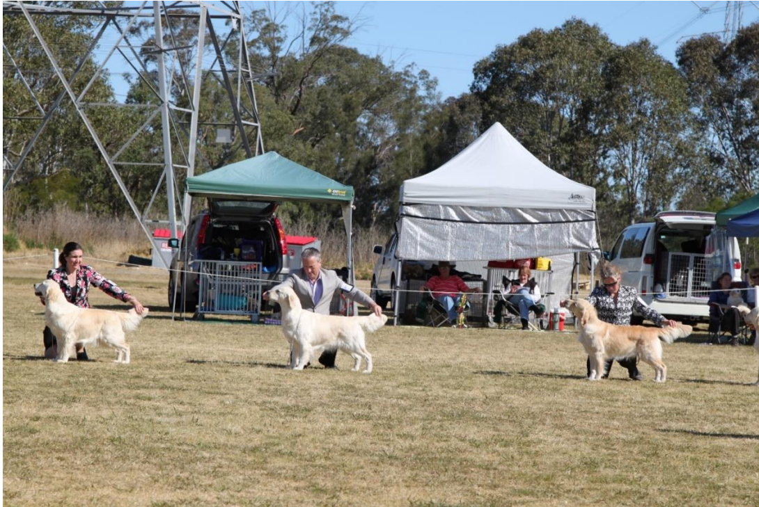
Photo L/R Giltedge Roll Out The Red Carpet (AI), Ch Fantango Say It With Style (AI), Bluebreeze on Cloud Nine

Photo L/R Montego Pretty Woman, Gr Ch Fantango Stack The Deck, Giltedge Roll Out The Red Carpet (AI)