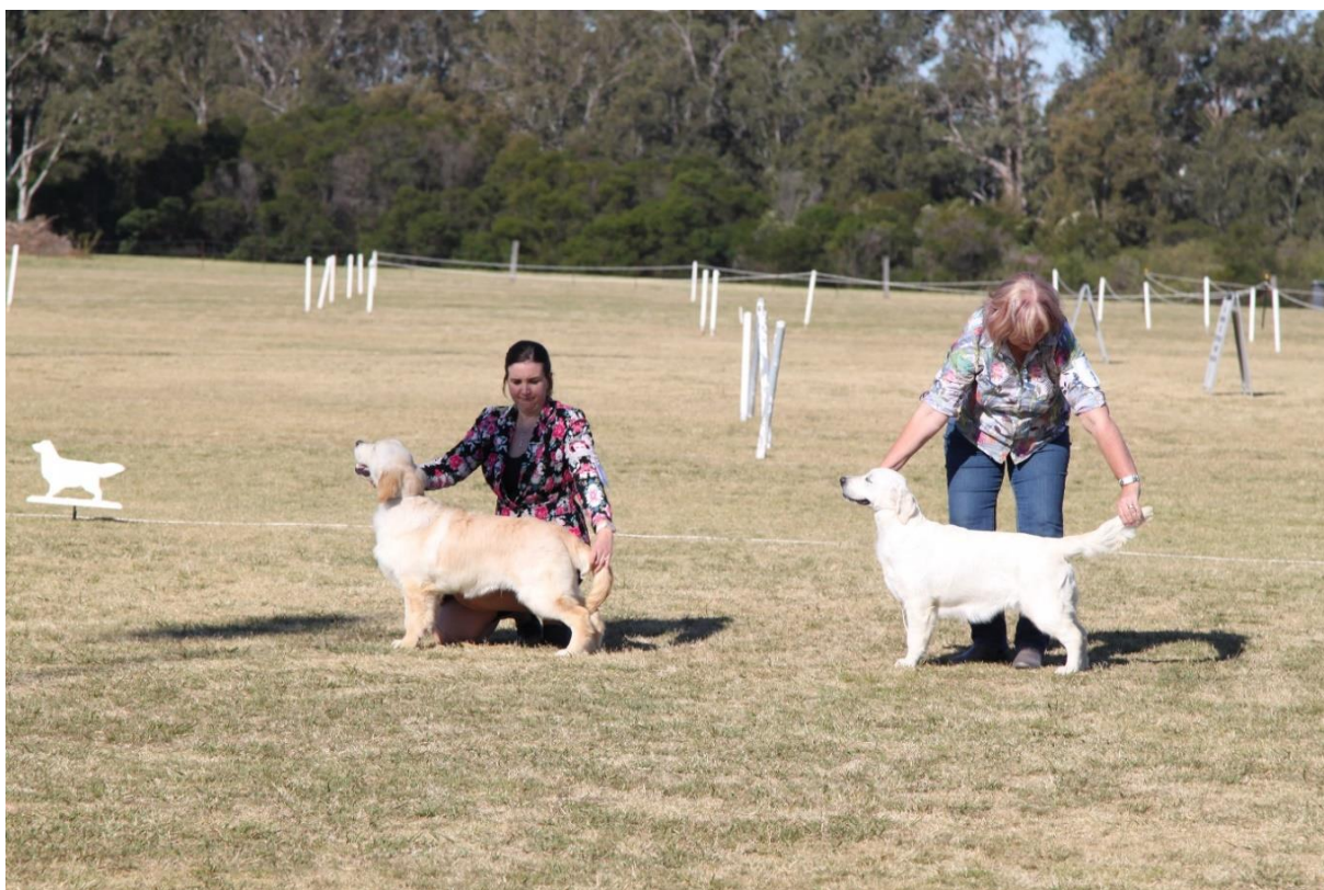
Photo Below: Puppy Dog** and Puppy Bitch competing for Puppy in Show