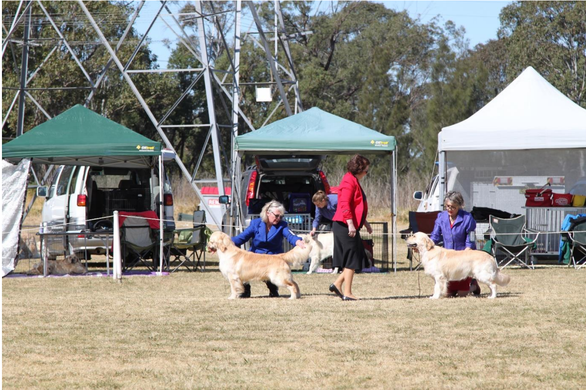
Photo L/R Giltedge Two Scoops or One (AI), Alnclair Crackerjack Crosby