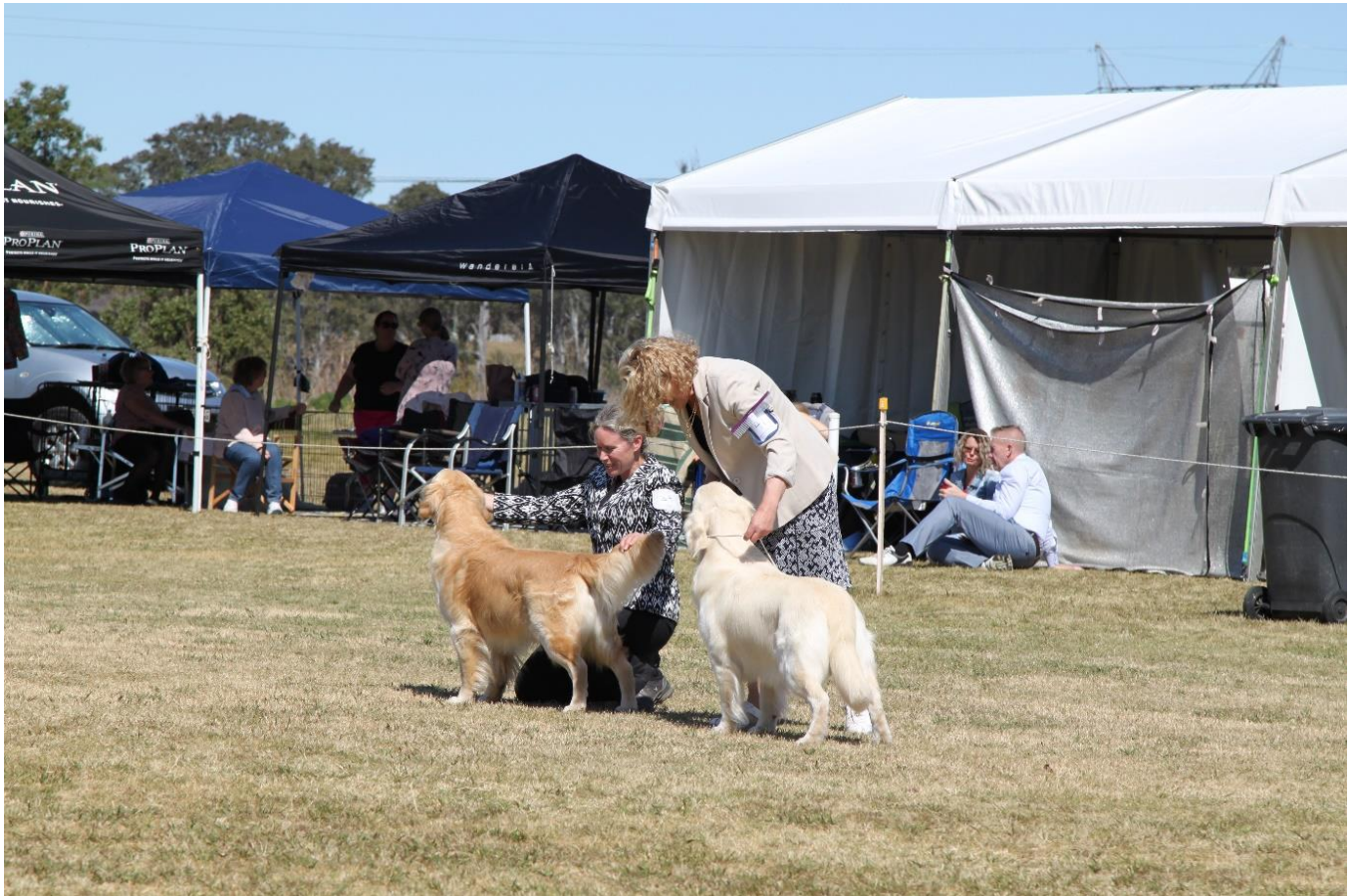
Photo L/R Ch Giltedge Do You Like Apples (AI), Gr Ch Fantango Playing The Game (AI)

These two Open dogs were stunners and handled to perfection.