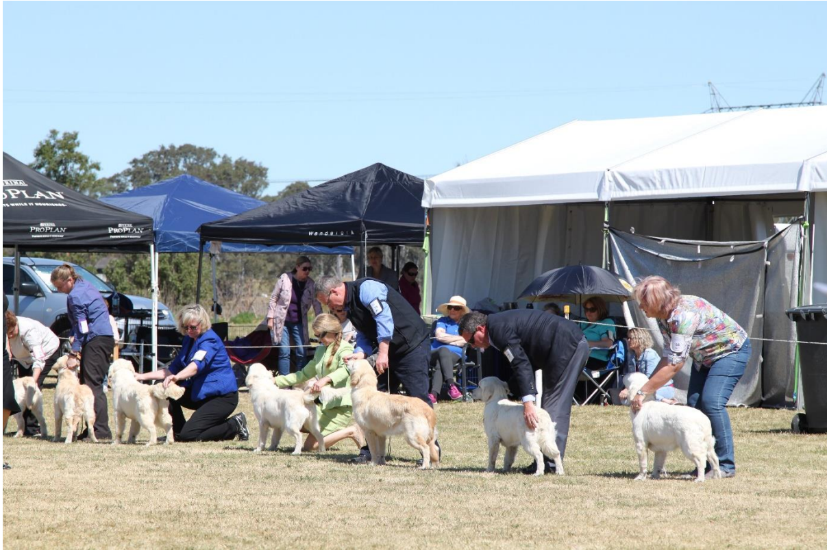
Photo L/R half obscured Dykinta Grand Quest(AI), Wynwhisper Practical Magic, Giltedge Catch my Act, Giltedge Hildegard, Burragundy Happy Hannah, Standndeliva a Pint O Ya Best, Alubyc Gentlemen Prefer Blondes