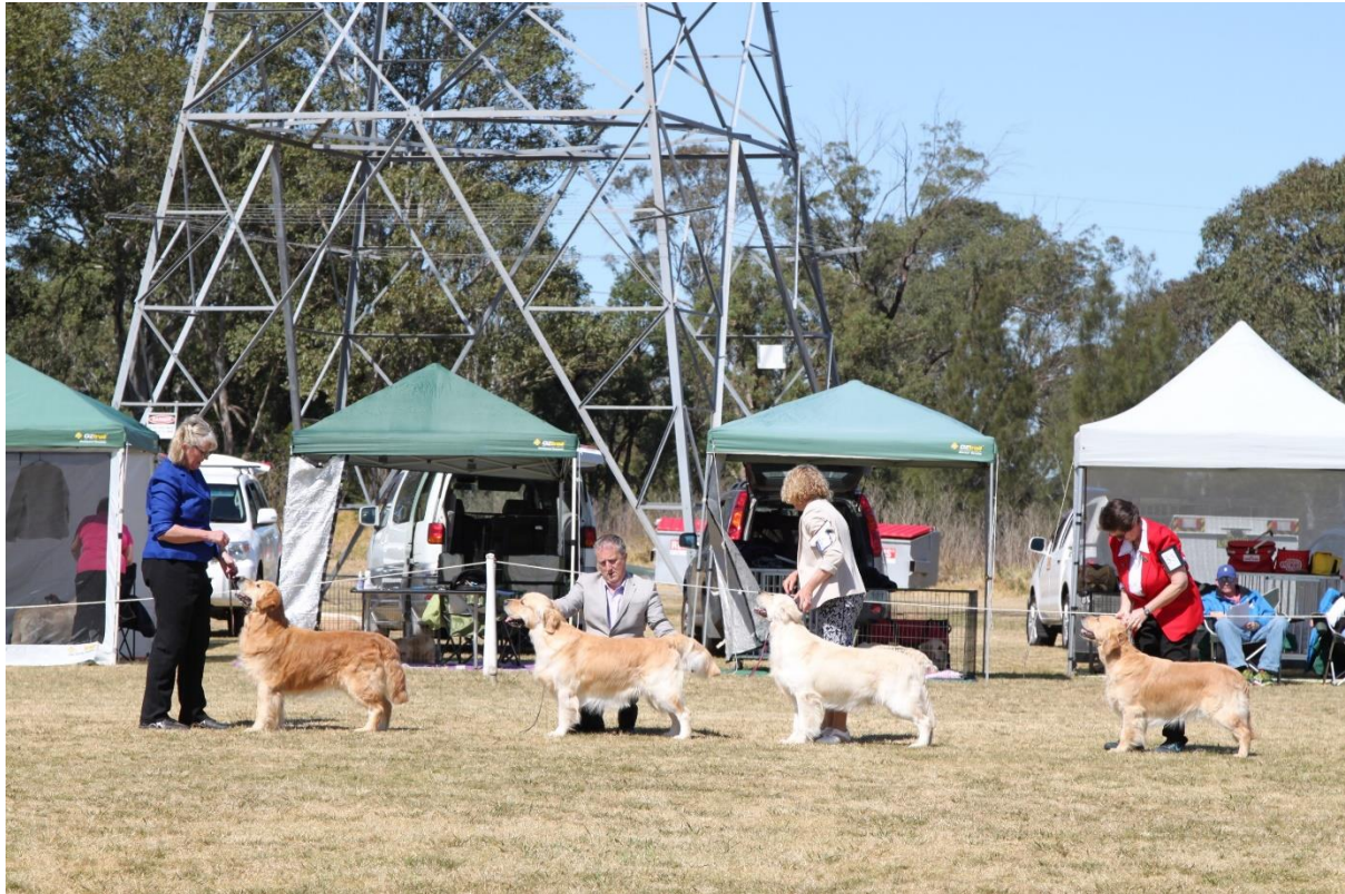
Photo below L/R Ch Goldew Southern Son, Ch Fantango Game Set N Match, Fantango Here Comes the Son(AI), Ch Goldkey Freedom Fighter