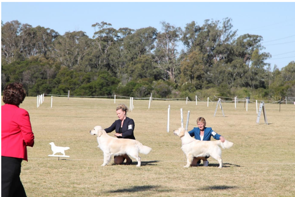
Photo Below: Baby Puppy Dog and Baby Puppy Bitch **competing for Baby Puppy in Show