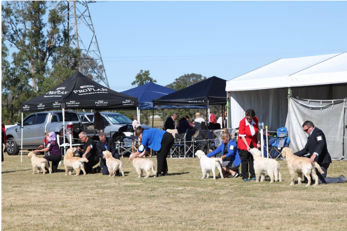
Photo below L/R Bluebreeze Over the Moon, Linketsis Rubenstein, Ainsleygold Someone Like You (AI) Askaval to Matana With Love, Elljooa Machu Picchu, Standndeliva King of Scots