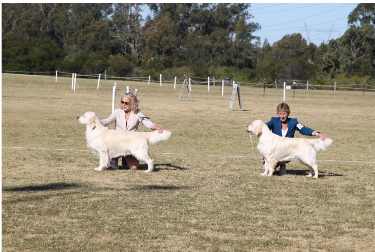
Photo Below: Reserve Challenge Dog and Bitch CC** competing for Runner Up Best In Show