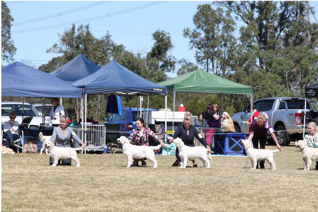
Photo below L/R Wembury Turn the Other Cheek, Montego euro Diamond Dancer, Askaval Frozen in Time, BLuebreeze Second from the Sun, Kulabay Catcher of Dreams