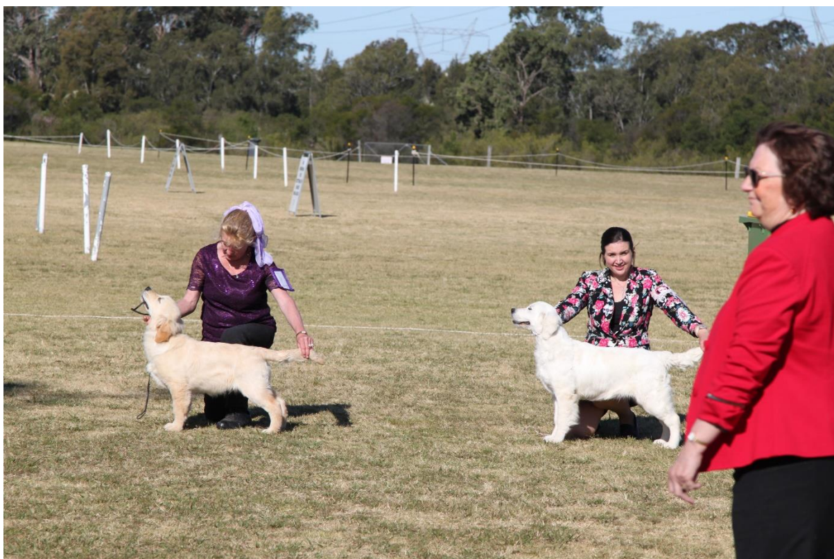
Photo Below: Minor Puppy Dog and Minor Puppy Bitch** competing for Minor Puppy in Show