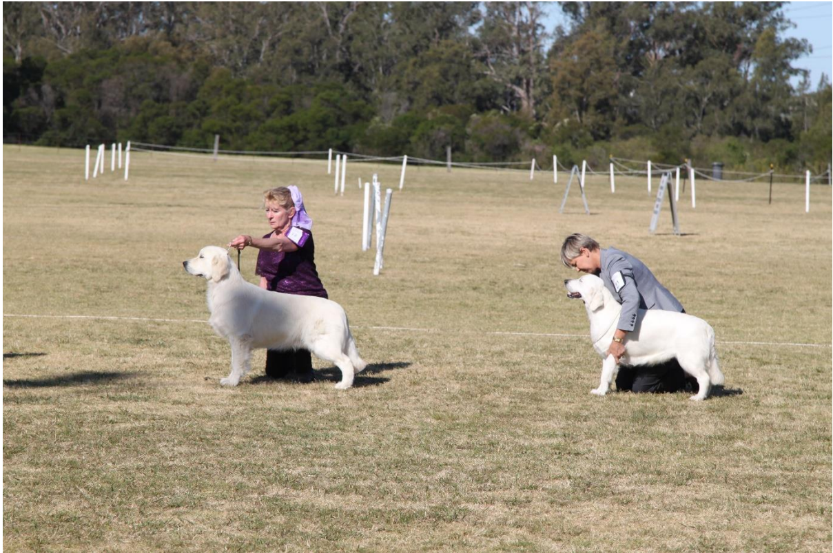
Photo Below: Junior Dog and Junior Bitch** competing for Junior in Show.