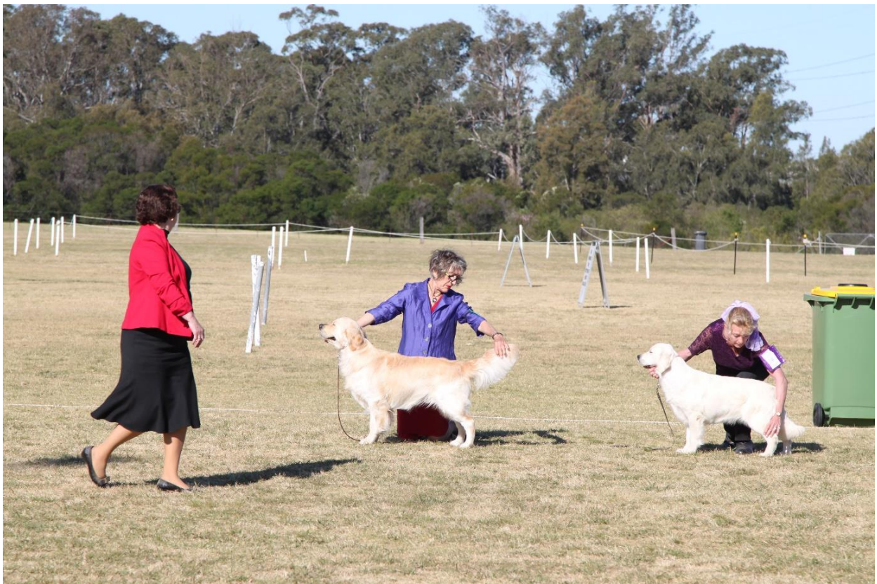
Photo Below: Neuter Dog and Neuter Bitch **competing for Neuter in Show