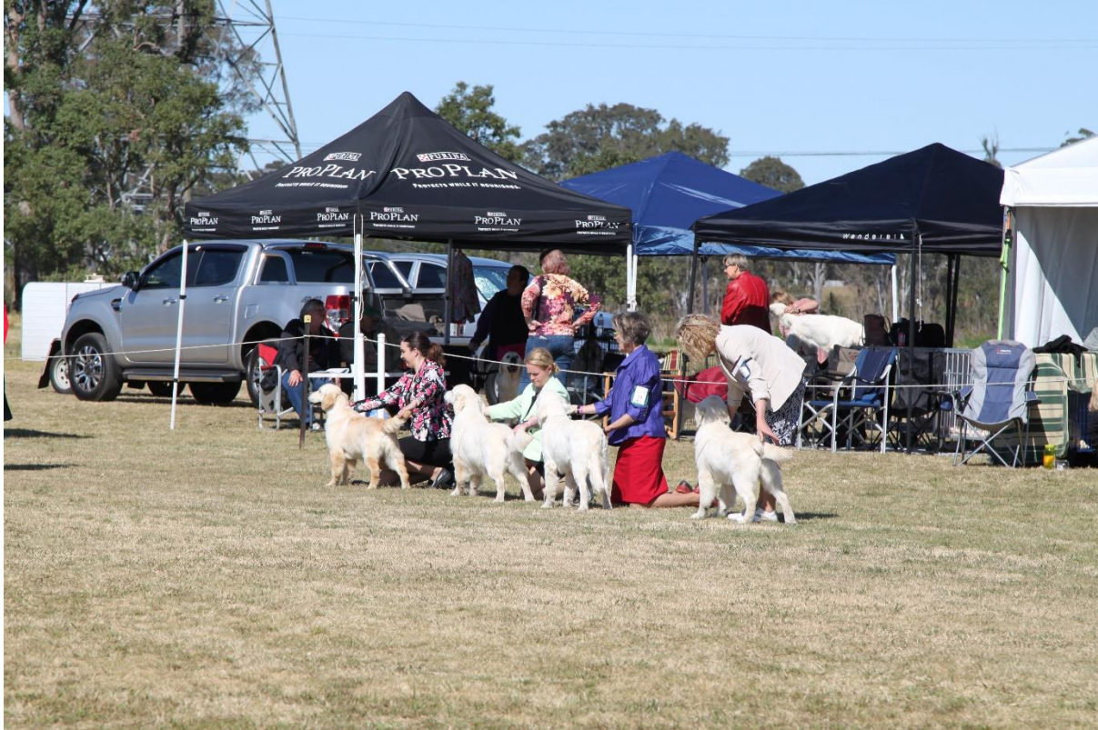
Photo Below L/R Goldbrior Da Vinci Code, Fantango Blame it on the Sun, Alnclair Thomas Bracken, Fantango Addicted to Love