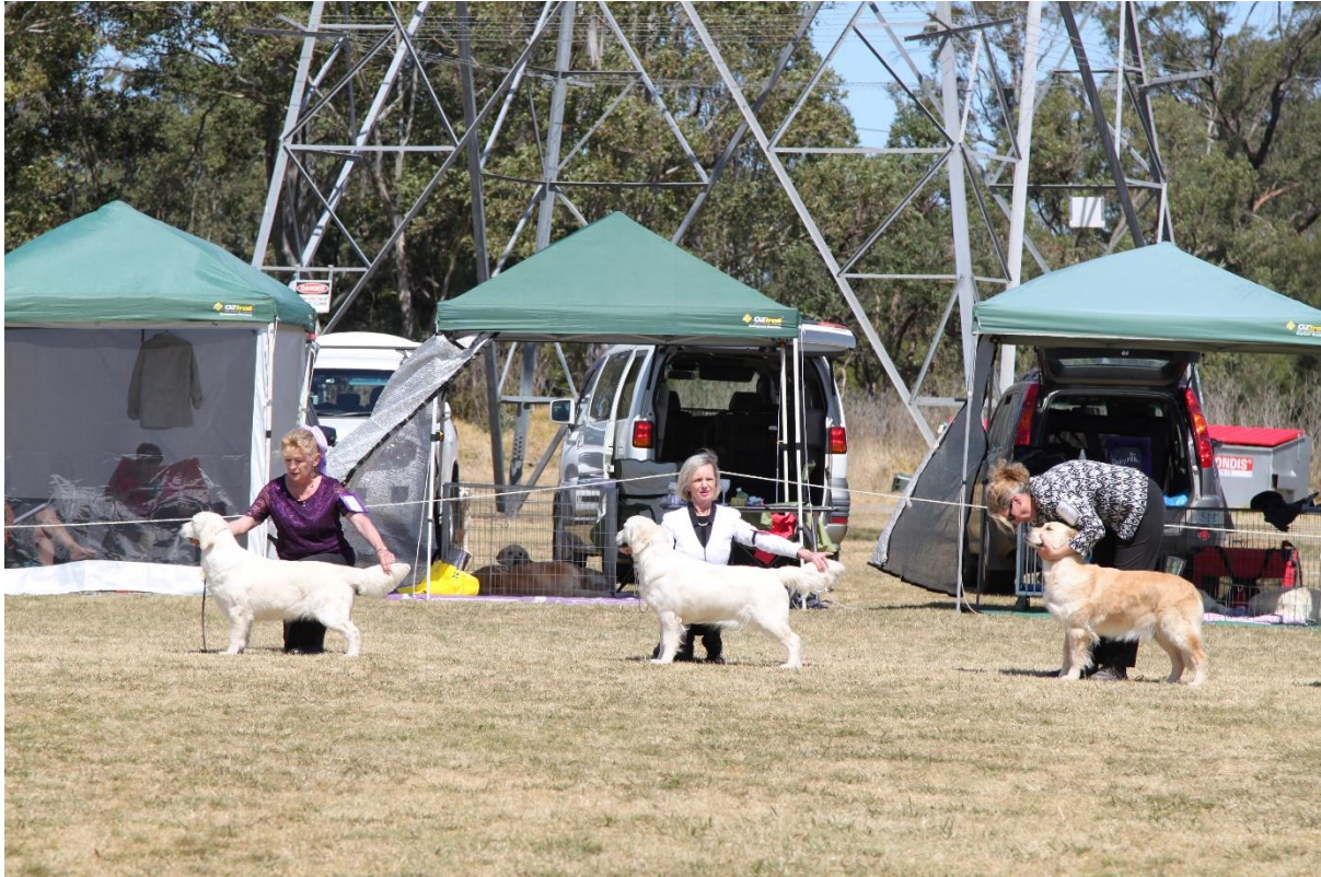
Photo L/R Bluebreeze on Cloud Nine, Cals Miami Attraction Toramgold, Giltedge One Scoop or Two (AI)