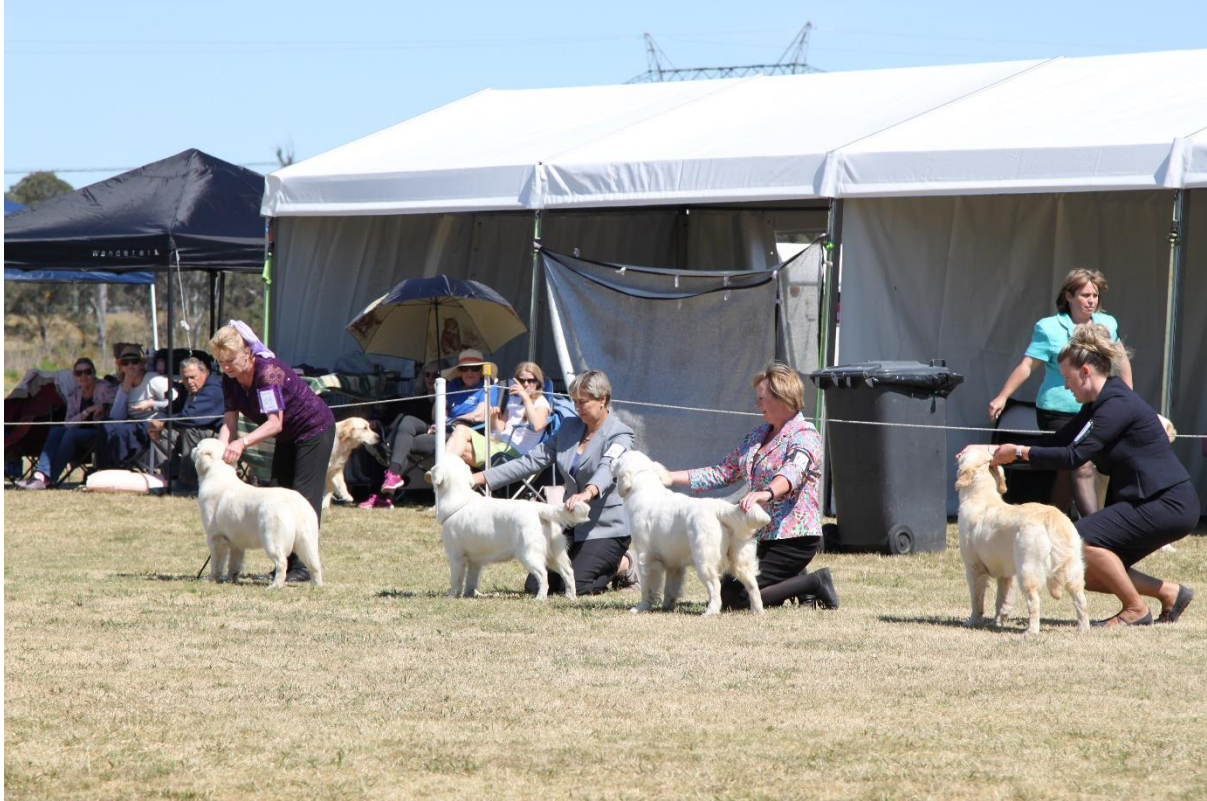
Photo L/R Bluebreeze Devine Intervention, Wembury Reason to Believe, Taleyah A lass from Ballymore, Elljoa Martini