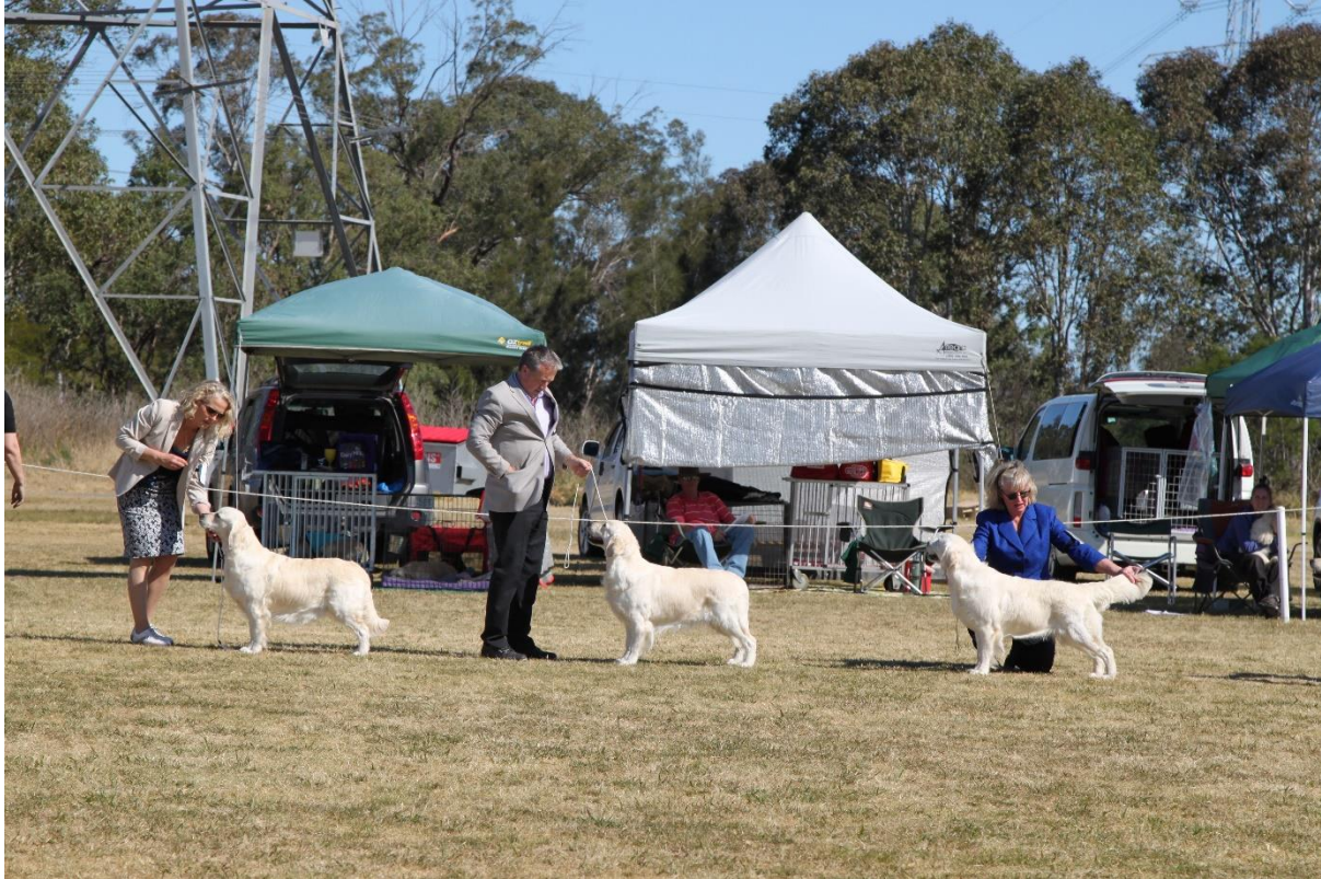
Photo L/R As Below Fantango Santa Monica, Gr Ch Fantango Stack the Deck, Giltedge When the Cats Away