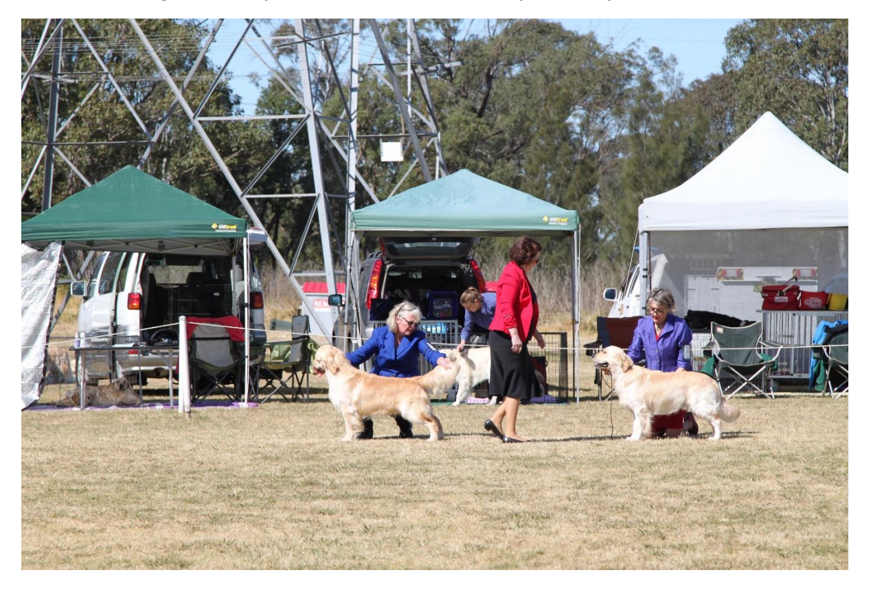
Photo L/R Giltedge Two Scoops or One (AI), Alnclair Crackerjack Crosby