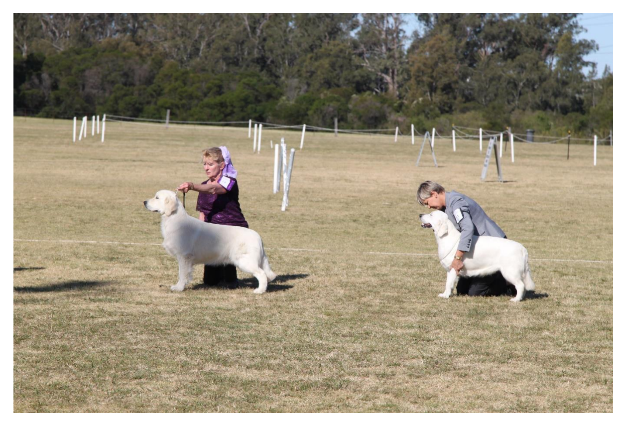
Photo Below: Junior Dog and Junior Bitch** competing for Junior in Show.

Photo Below: Puppy Dog** and Puppy Bitch competing for Puppy in Show