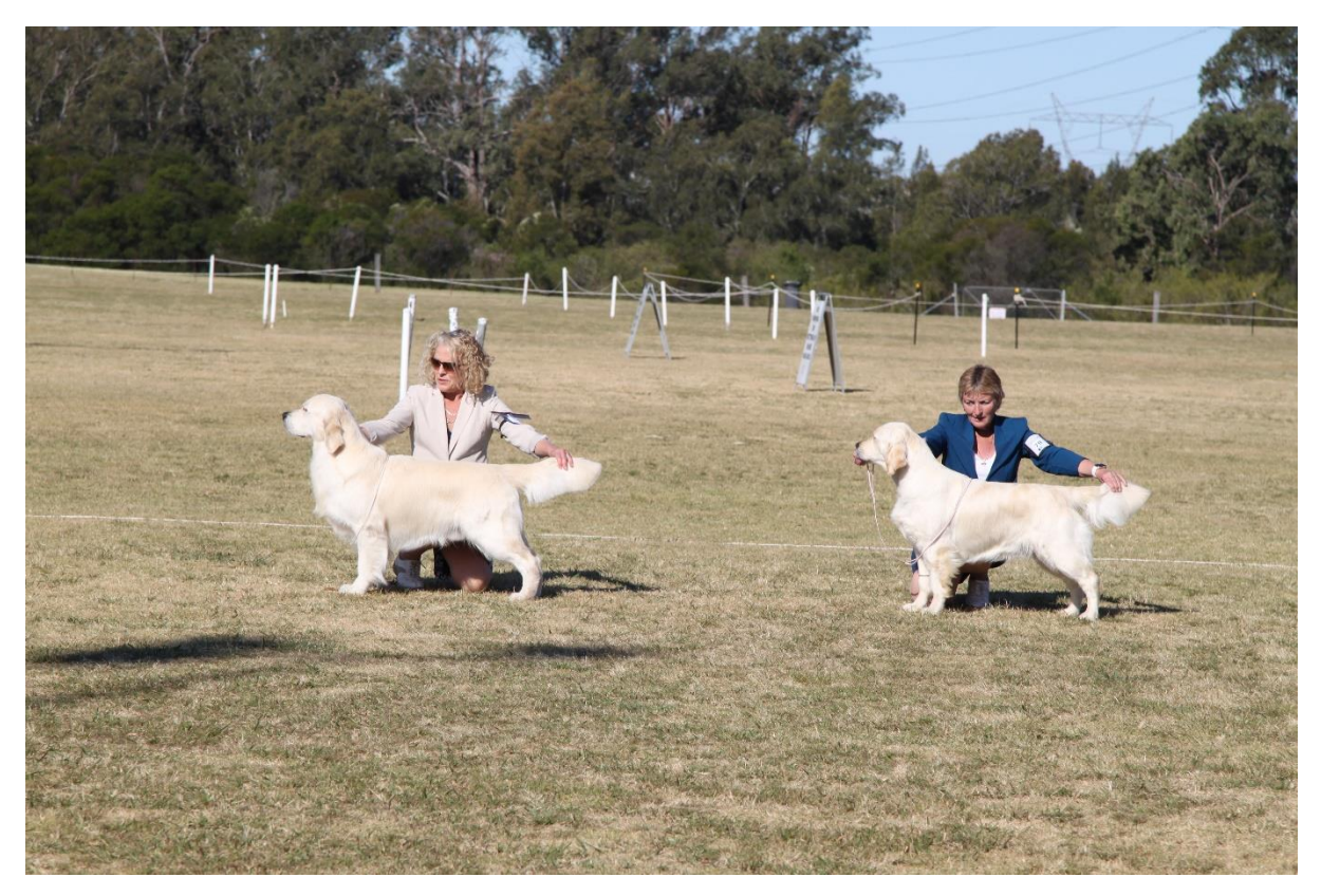
Photo Below: Reserve Challenge Dog and Bitch CC** competing for Runner Up Best In Show