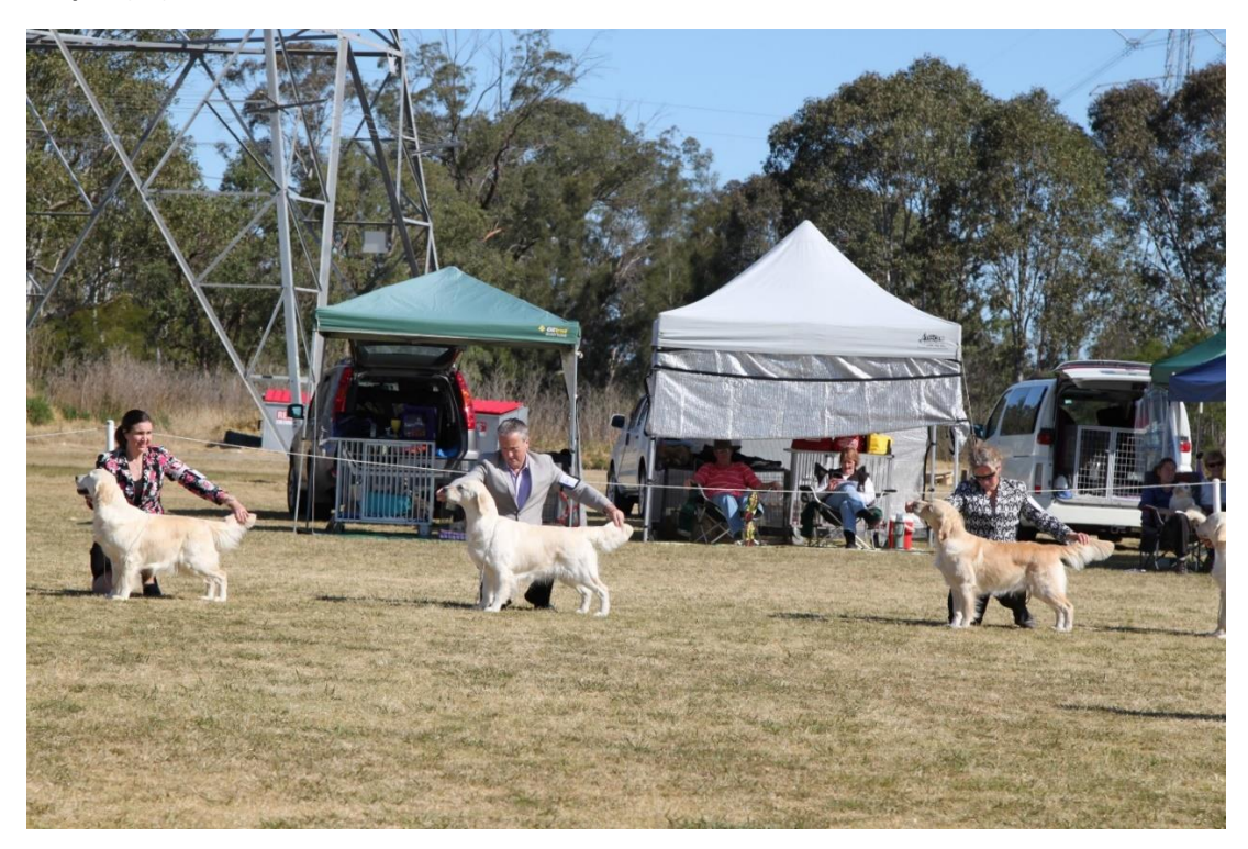
Photo L/R Giltedge Roll Out The Red Carpet (AI), Ch Fantango Say It With Style (AI), Bluebreeze on Cloud Nine

Photo L/R Montego Pretty Woman, Gr Ch Fantango Stack The Deck, Giltedge Roll Out The Red Carpet (AI)