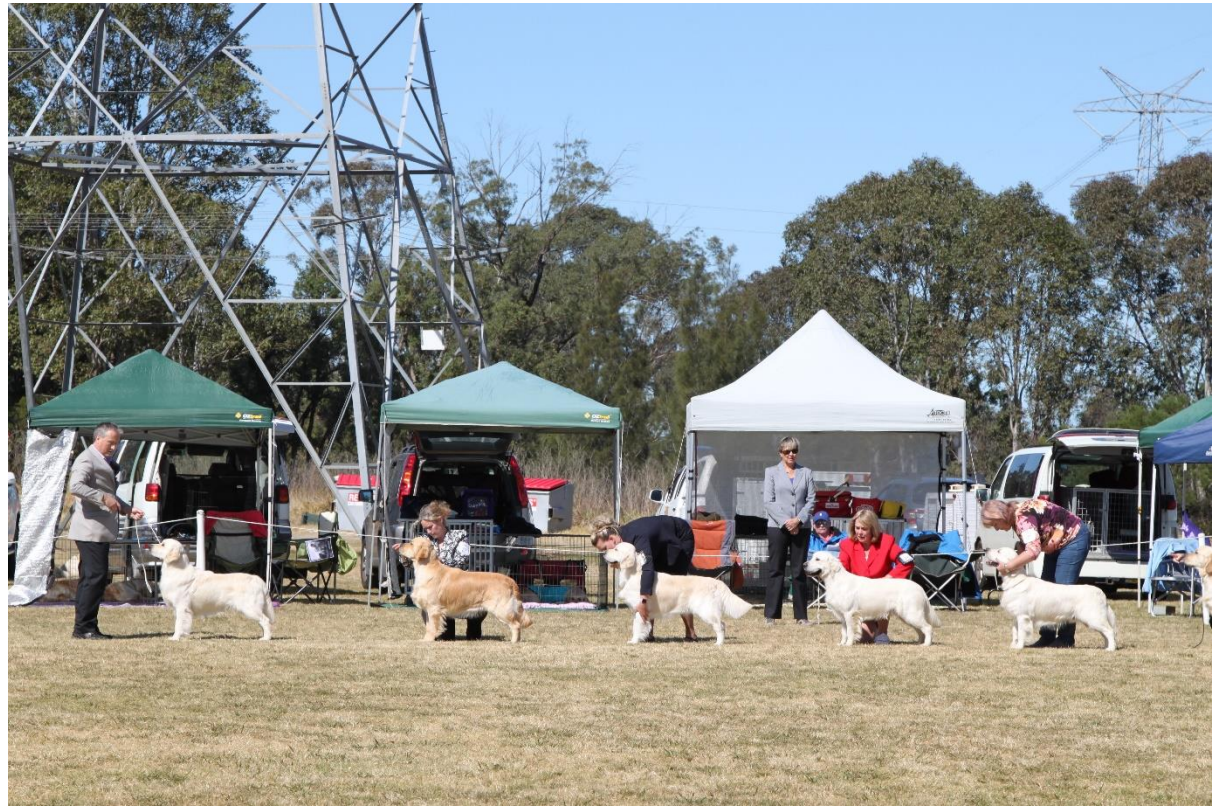
Photo below L/R Fantango What Happens in Vegas (AI), Ch Shtar Seal of Approval, Ch Piarki Winston's Golden Ticket, Parkridge Cause I Can, Zenevieva North Atlantic Drift (imp)

A wonderful class full of beautiful dogs.