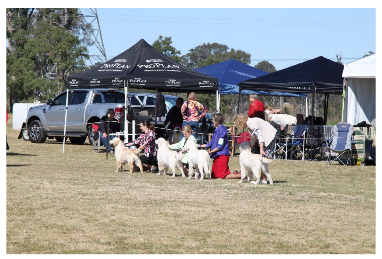
Photo Below L/R Goldbrior Da Vinci Code, Fantango Blame it on the Sun, Alnclair Thomas Bracken, Fantango Addicted to Love