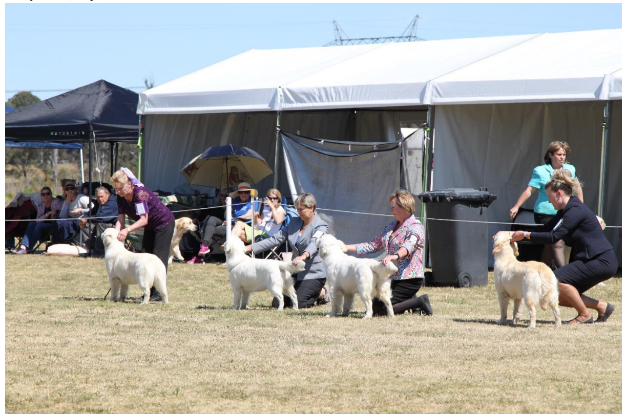
Photo L/R Bluebreeze Devine Intervention, Wembury Reason to Believe, Taleyah A lass from Ballymore, Elljoa Martini