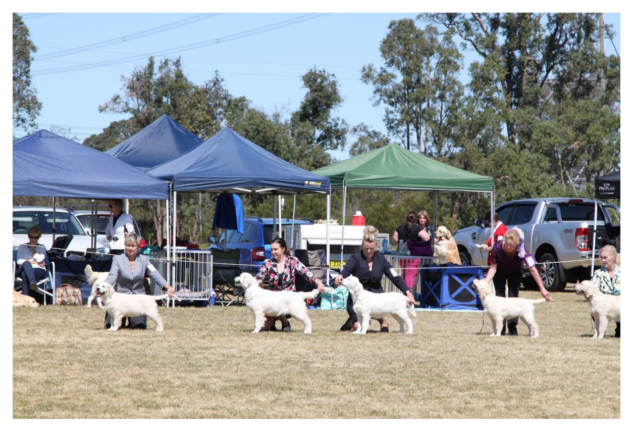
Photo below L/R Wembury Turn the Other Cheek, Montego euro Diamond Dancer, Askaval Frozen in Time, BLuebreeze Second from the Sun, Kulabay Catcher of Dreams