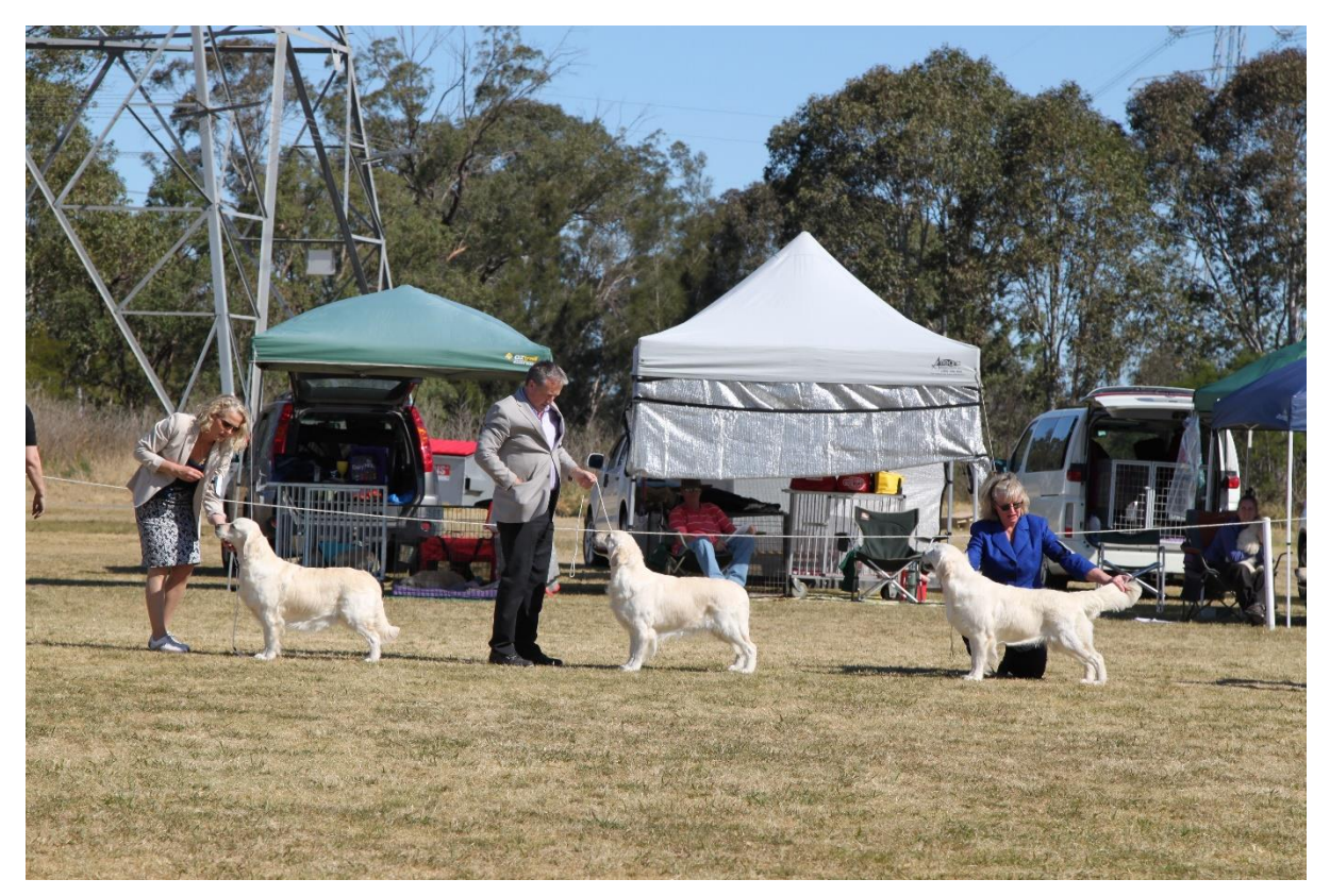
Photo L/R As Below Fantango Santa Monica, Gr Ch Fantango Stack the Deck, Giltedge When the Cats Away