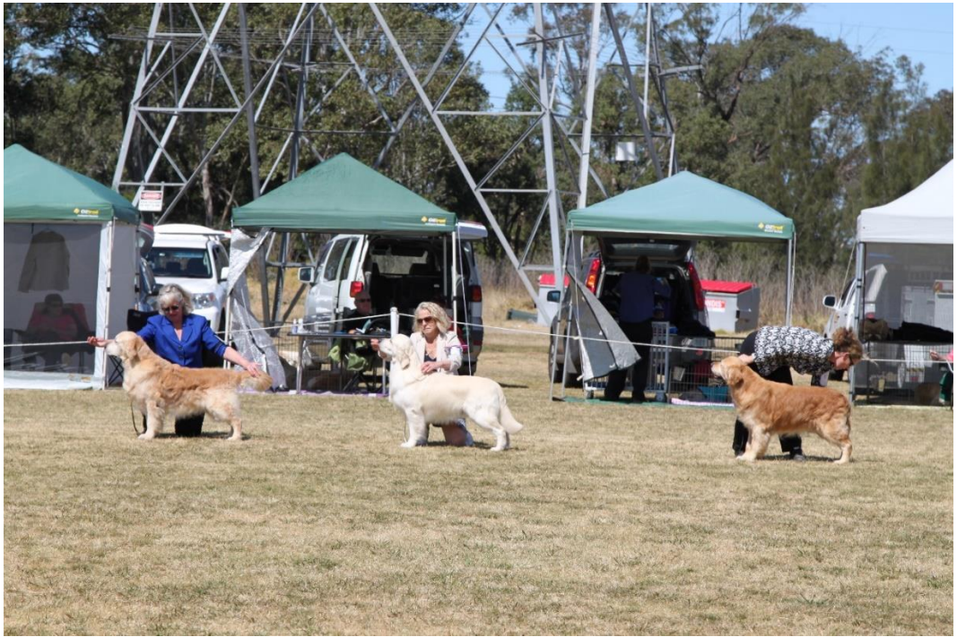
Photo below L/R Ch Goldew Southern Son, Ch Piarki Winston's Golden Ticket, Alnclair Crackerjack Crosby

Photo below L/R Ch Larbellah Team Leader, Gr Ch Fantango Playing the Game (AI)., Ch Goldew Southern Son