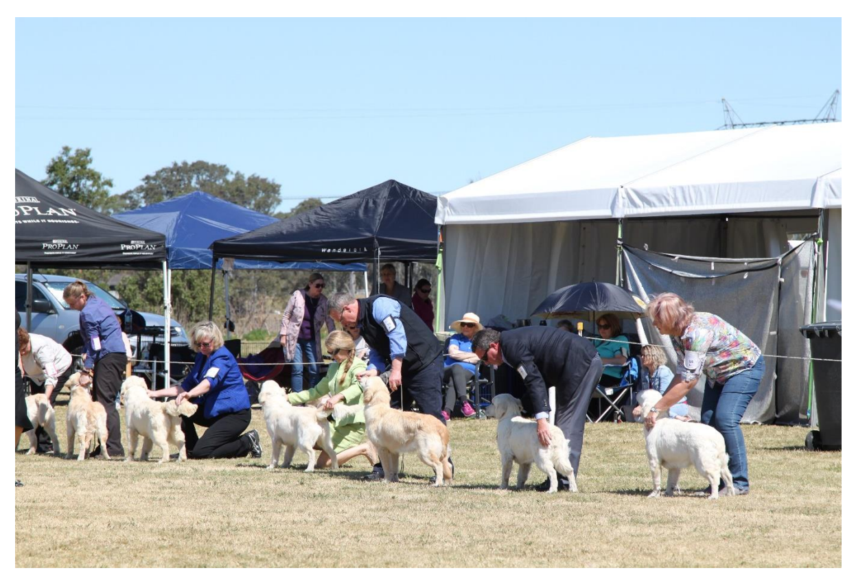
Photo L/R half obscured Dykinta Grand Quest(AI), Wynwhisper Practical Magic, Giltedge Catch my Act, Giltedge Hildegard, Burragundy Happy Hannah, Standndeliva a Pint O Ya Best, Alubyc Gentlemen Prefer Blondes