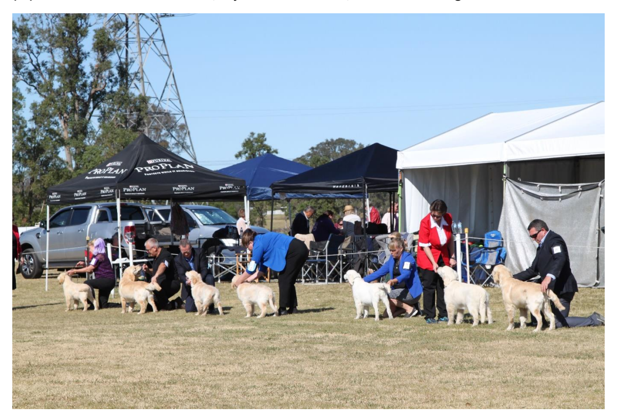
Photo below L/R Bluebreeze Over the Moon, Linketsis Rubenstain, Ainsleygold Someone Like You (AI) Askaval to Matana With Love, Elljooa Machu Picchu, Standndeliva King of Scots