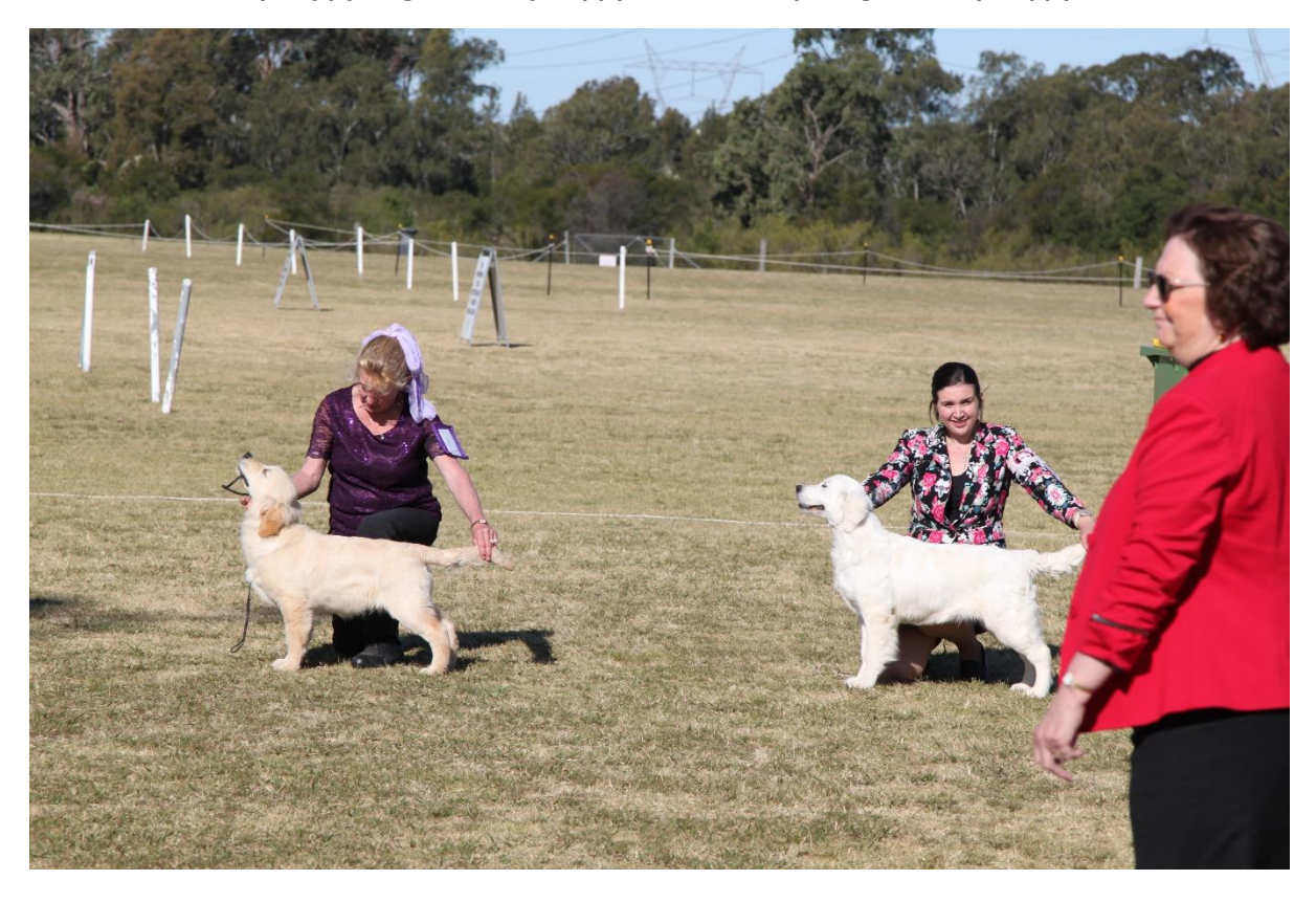
Photo Below: Minor Puppy Dog and Minor Puppy Bitch** competing for Minor Puppy in Show

Photo Below: Baby Puppy Dog and Baby Puppy Bitch **competing for Baby Puppy in Show