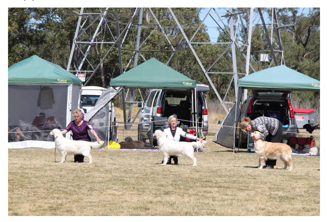
Photo L/R Bluebreeze on Cloud Nine, Cals Miami Attraction Toramgold, Giltedge One Scoop or Two (AI)