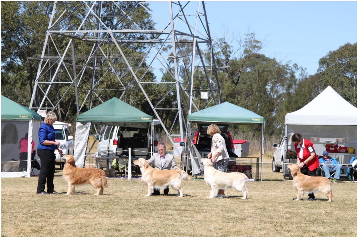
Photo below L/R Ch Goldew Southern Son, Ch Fantango Game Set N Match, Fantango Here Comes the Son(AI), Ch Goldkey Freedom Fighter