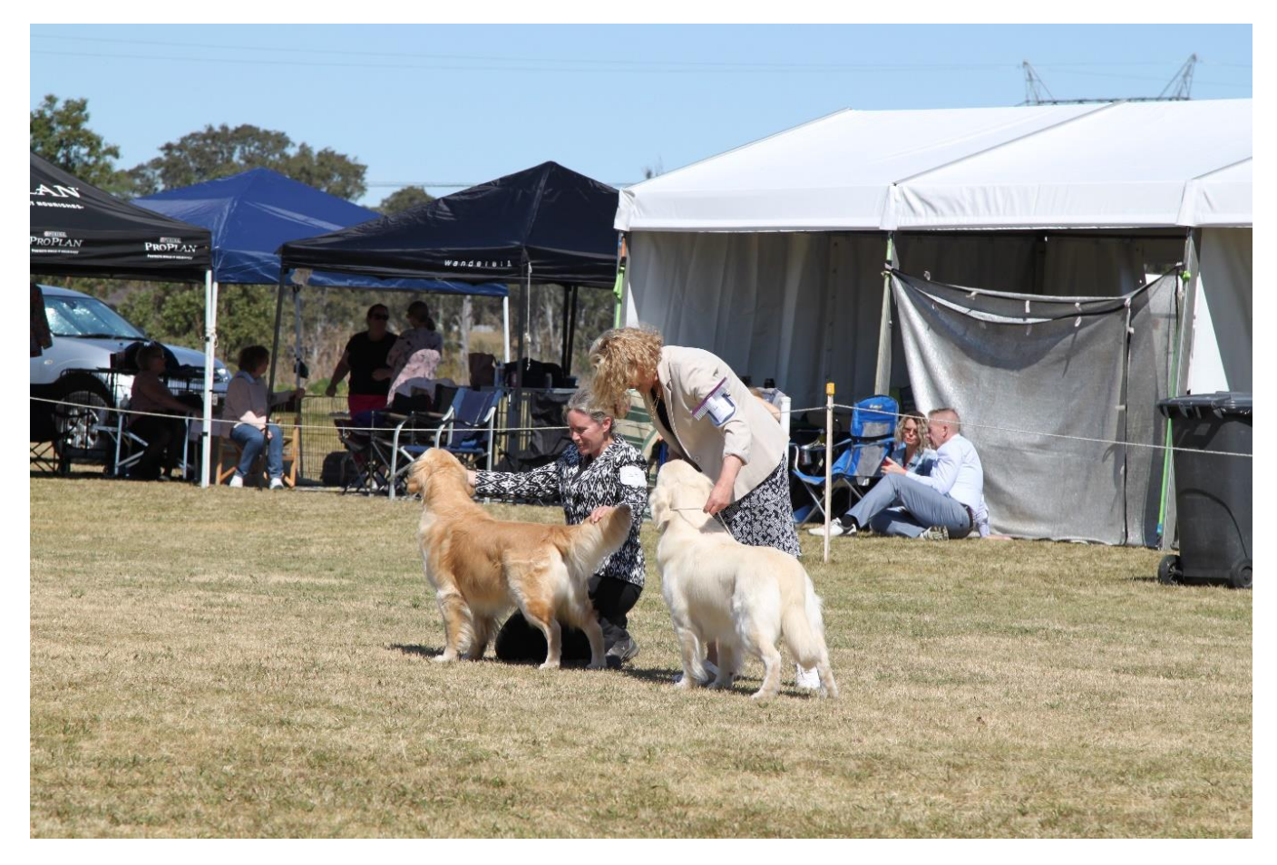
Photo L/R Ch Giltedge Do You Like Apples (AI), Gr Ch Fantango Playing The Game (AI)

1. Supr Ch Fantango Playing the Game (AI) – Mr P Middleton and Ms J Salvestrin A classically beautiful Golden Retriever teeming with quality. Lovely head and expression. Correct bone straight front with correct catlike feet. Neck of good length sloping gently into well laid shoulders. Deep chest. Level topline with correct tail set and length. Well bent stifle with well let down hocks. In hard working condition, he moved powerfully and effortlessly with reach and drive. A picture of balance and proportion. Newer exhibitors could learn much from the way this stunning dog is groomed, trimmed, presented and handled. A dog with such presence I felt very honoured to have the opportunity to award him the Dog Challenge and Best in Show. He is world class. Dog Challenge/ Best in Show/ Open in Show